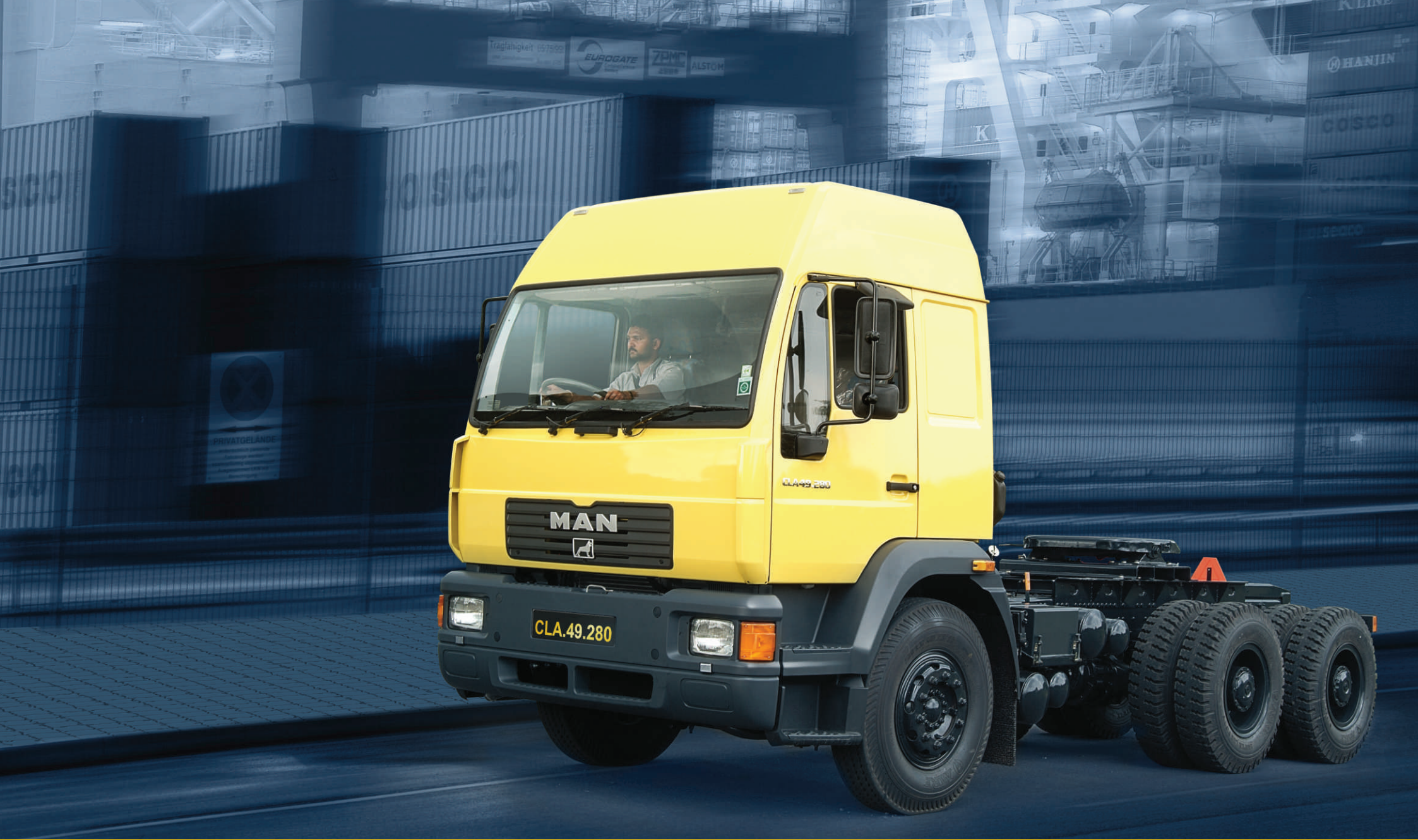
MAN CLA 49.280 6x4 Tractor Head