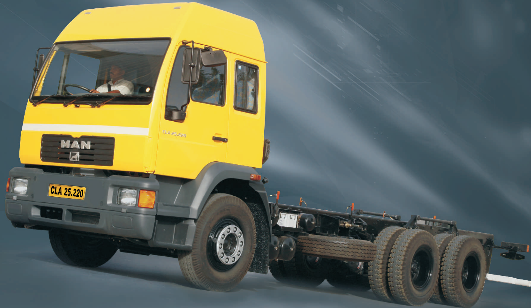
MAN CLA 25.220 6x2 Chassis with Cab